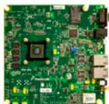
QorIQ Qonverge BSC9131 Reference Design Board

The QorIQ Qonverge line of products has a proven set of hardware and software tools for code development and debug. The CodeWarrior Development Studio is a comprehensive integrated development environment (IDE) that provides a highly visual and automated framework to accelerate the development of the most complex embedded applications. The CodeWarrior tools allow a consistent look and feel for developing code on both cores as opposed to competing solutions that may require multiple debugging platforms. In addition to the IDE, the BSC9131RDB and BSC9132QDS give you the ability to develop and test code on hardware systems before developing your own hardware solution.