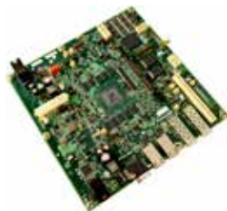
QorIQ Qonverge BSC9132 Development Board